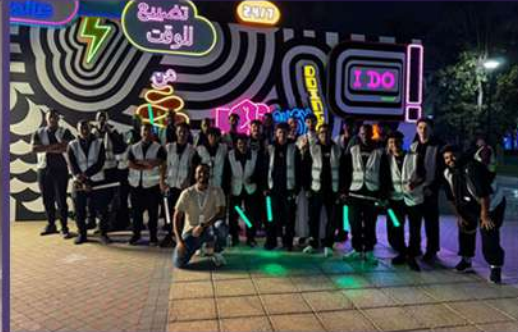
Riyadh Noor Riyadh