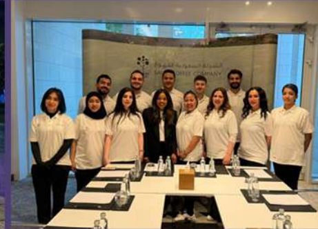
Riyadh Saudi Coffee Competition