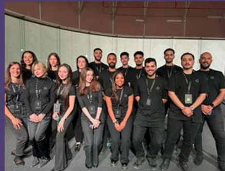
Riyadh Tasawar Event - SnapShot