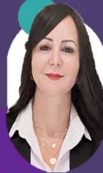
■ Essia Staff Recruiter