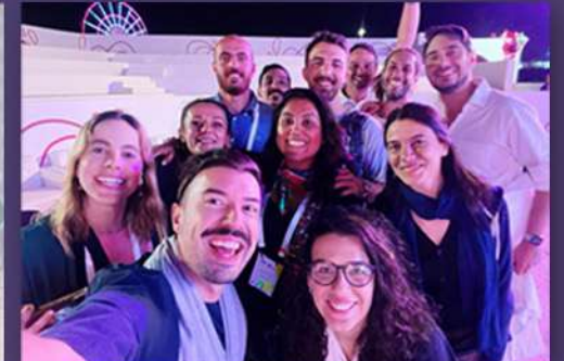
AL Taif Festival 2023