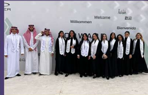
Riyadh Ceer Annual Anniversary