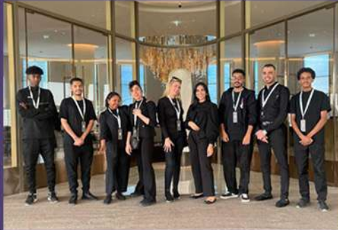
Riyadh Alfaisaliyah Hotel